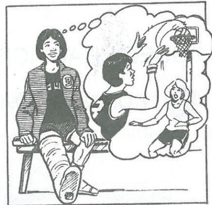
infinitive future > (hope)

she hopes she puts the ball into basket. she hopes she can play basketball. she hopes make the basket.